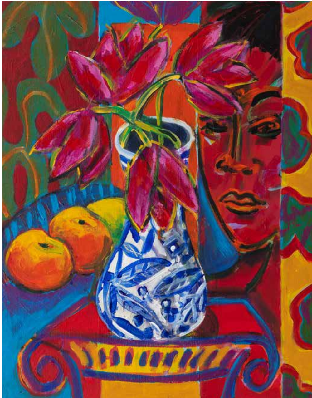
Tahitian Tulips Acrylic on canvas 50 x 40 cm