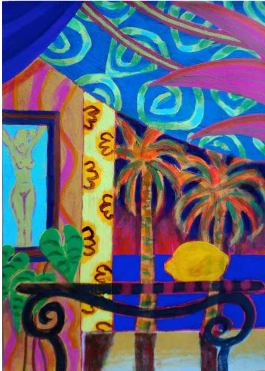
The Green Fairy Acrylic on paper 35 x 25 cm