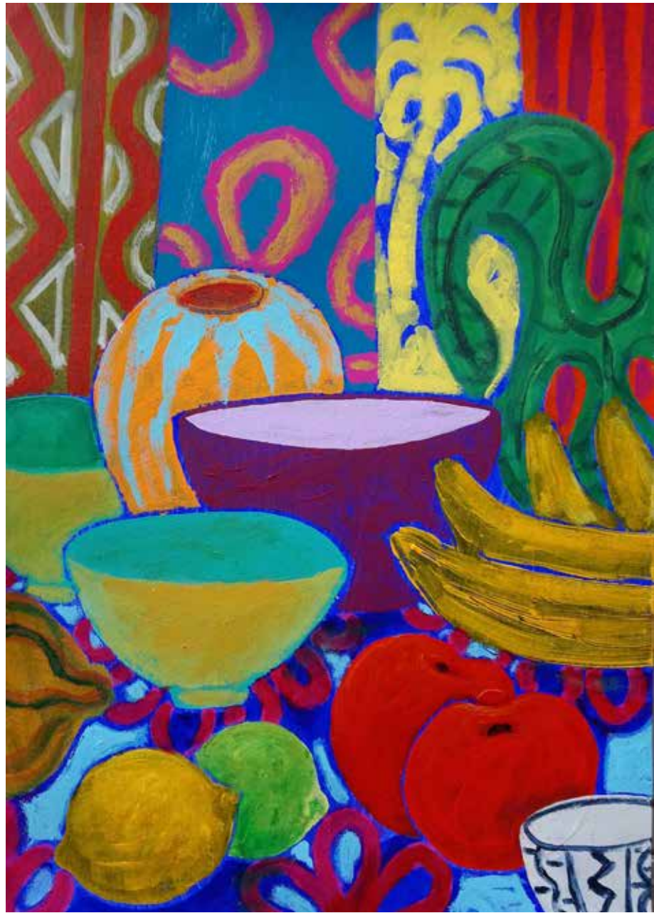
The Banquet Acrylic on paper 35 x 25 cm