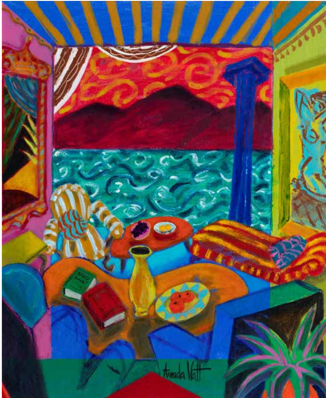
Naked Lunch Acrylic on canvas 60 x 50 cm