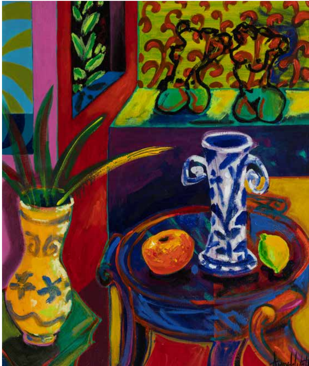
Martel Avenue Acrylic on canvas 60 x 50 cm